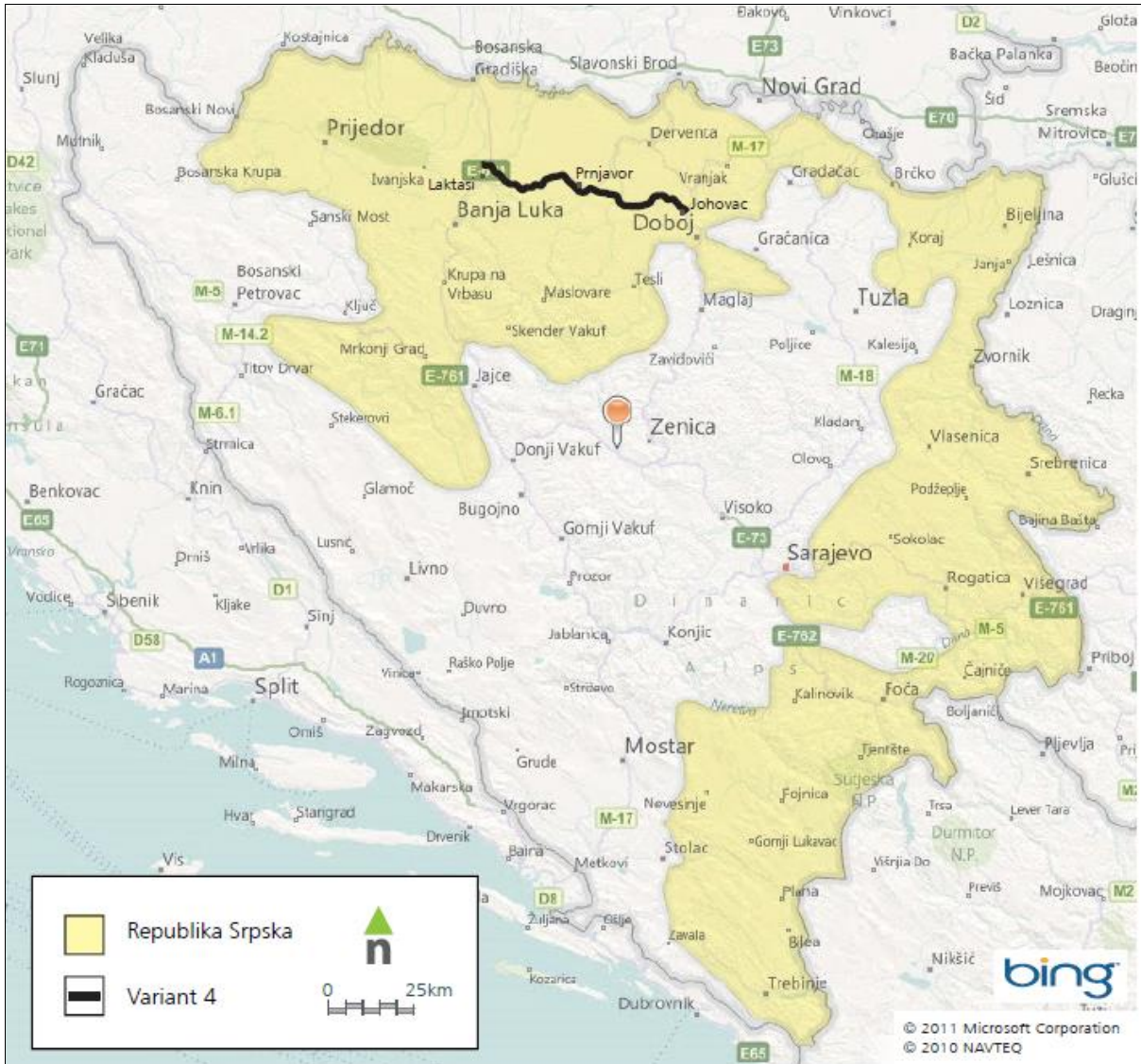
Figure 2.1: Location of Proposed Banja Luka to Doboj Motorway