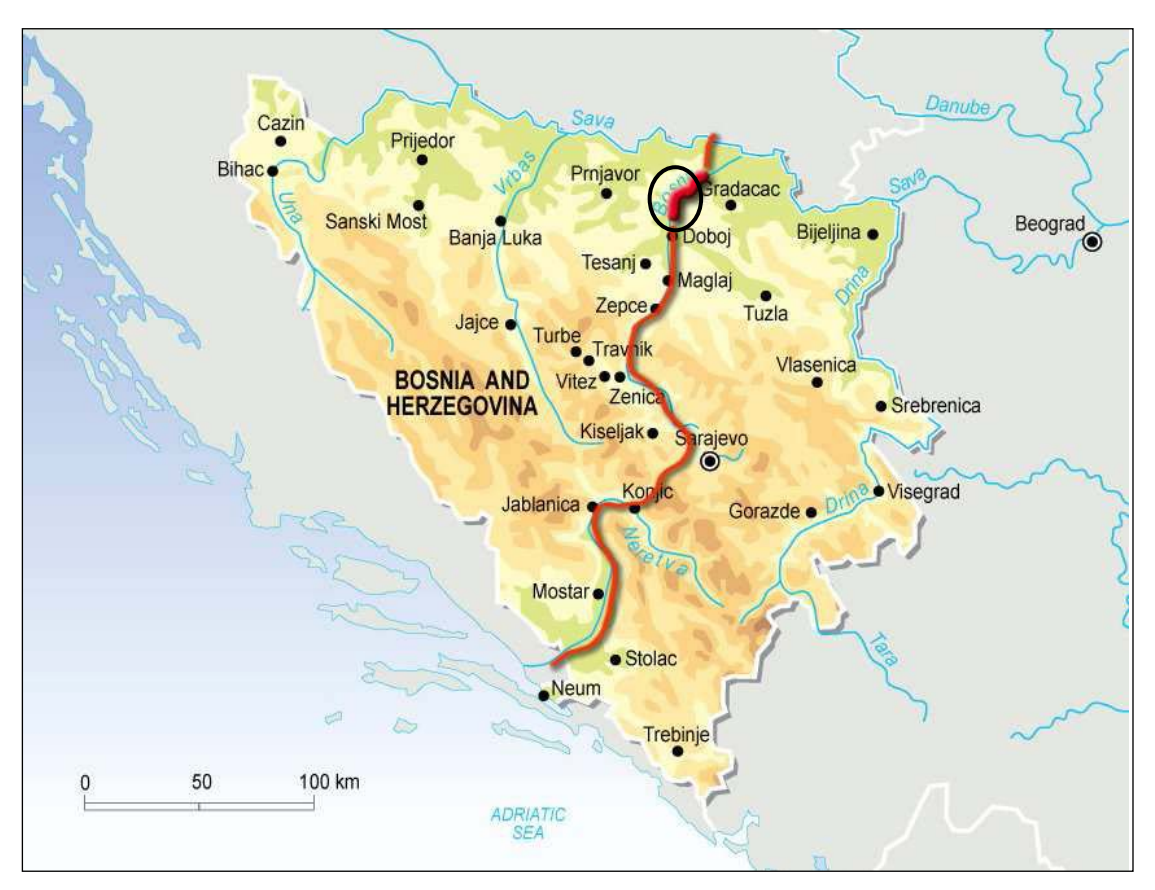
Figure 2-1 Project Location<sup>1</sup>

The SEP outlines a systematic approach to stakeholder engagement that will help RSM and the Project build and maintain over time a constructive relationship with their stakeholders, in particular the locally affected communities. The document also includes a grievance mechanism for stakeholders to raise their concerns about the Project.